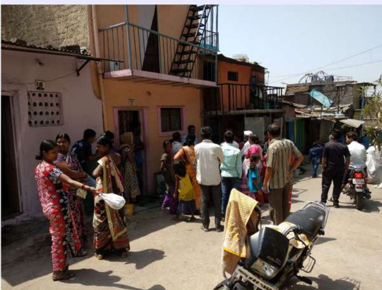
fig 6. FOCUS GROUP DISCUSSION IN ANAND NAGAR, PCMC