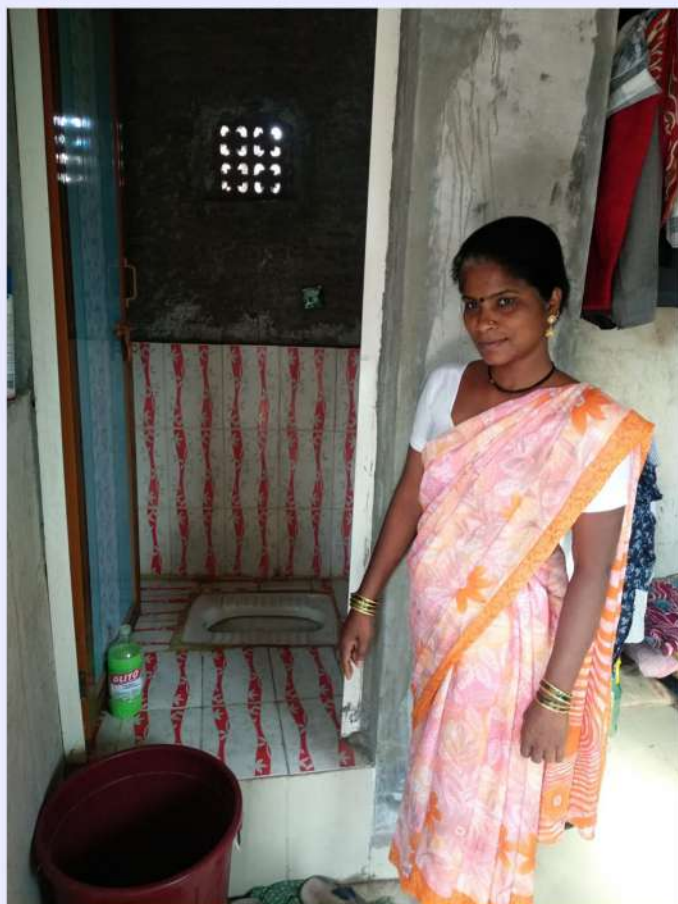
fig 3. ONE OF THE BENEFICIARY AND HER HOUSEHOLD TOILET IN ANAND NAGAR SETTLEMENT