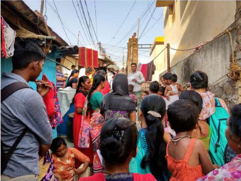
fig 4. PICTURE OF A CORNER MEETING CONDUCTED IN ANAND NAGAR, PCMC