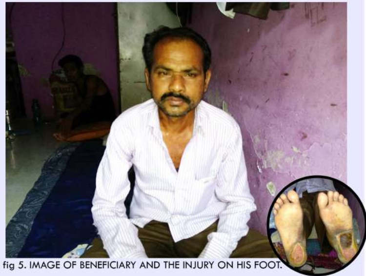
fig 5. IMAGE OF BENEFICIARY AND THE INJURY ON HIS FOOT.

Even with the help of people providing funds and building their individual toilets Anand Nagar still stands to be one of the most openly defecating communities in PCMC due to the fact that there are very few drainage lines and the fact that laying septic tanks or any other form of drainage is not feasible in this settlement.