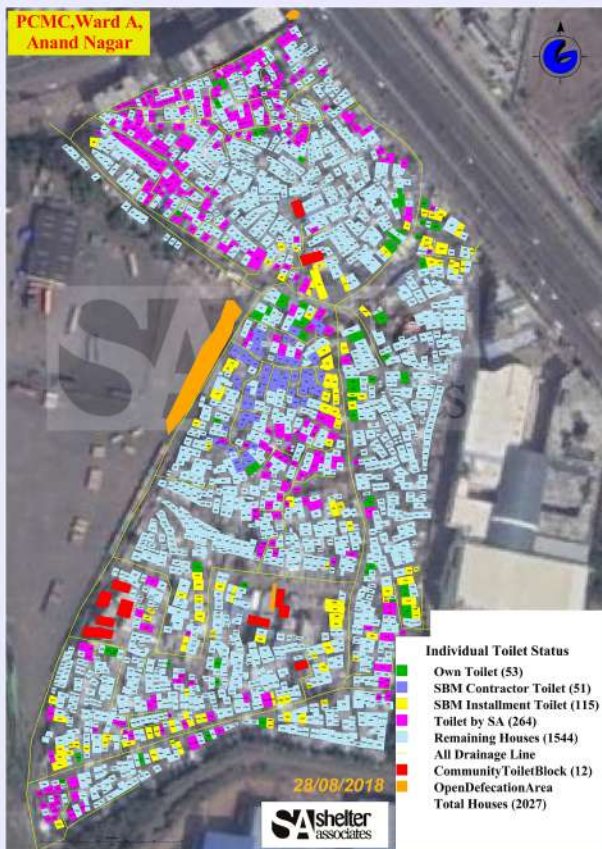
fig 1. PRE SA INTERVENTION MAP OF ANAND NAGAR