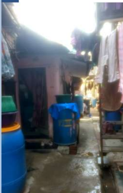
Street outside their house.