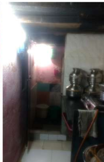
Toilet after construction.