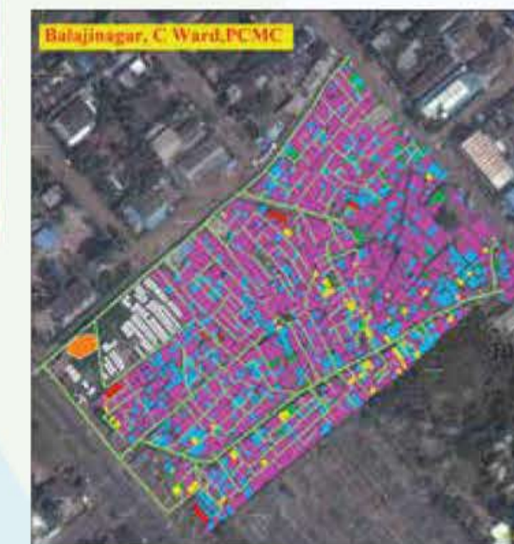
Post Intervention impact-Balaji Nagar, PCMC

geographic data from different sources is integrated onto a GIS platform. Several layers viz. sewer access locations, gutter lines, garbage bins, roads, water stand posts, taps, and community toilet blocks are then added. The household-level data obtained from Rapid Household Surveys (RHS) is attached to the digitized data. Following which the SA GIS team builds complex queries of the data, checking whether all houses on map are numbered, measuring proximity to water supply and drainage, identifying the occupancy of the structures, identifying the location of waste collection. This spatial data on analysis, gives rise to a comprehensive real time dataset which helps in targeting urban informal settlements strategically for carrying out interventions.