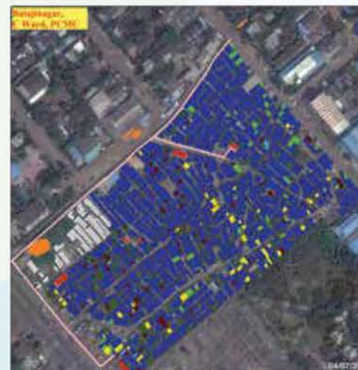
Pre intervention: Identifying the current places for defecation in Balajinagar settlement, Pimpri-Chinchwad

The success of any mission or program depends upon the credible data and an institutionalized tracking mechanism to measure the impacts or the adversities. Currently, in most of the Indian cities' plan there is dearth of precise data and if at all it is present, it is typically secondary data. It does not contain a detailed understanding of the existing