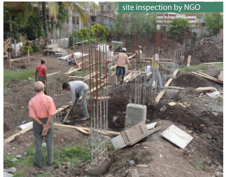
site inspection by NGO

The architects of this project are Shelter Associates (SA) which is an NGO and a consultant appointed by the SMKMC to prepare the DPR. However the contract awarded to Stresscrete India was on a