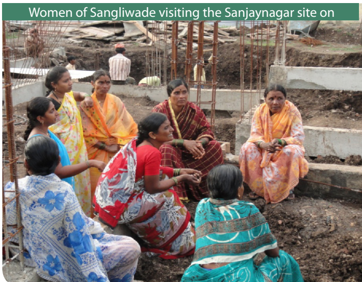
Women of Sangliwade visiting the Sanjaynagar site on

turn key basis which included preparation of all technical drawings by appointing a structural consultant and a local liason architect. This despite the fact that all these drawings have already been submitted by SA. Once a week, the NGO architect and an eminent structural engineer of Sangli who has volunteered, inspect the sites. Then a report is prepared by the engineer which is emailed to the SMKMC. Very simple systems like maintaining a log entry book on site for visitors and their comments, material consumption record, provision of detailed working drawings etc. are being set up due to this sustained effort. T SMKMC has also been consulting the structural engineer working with the NGO, for a second opinion on certain technical drawings.