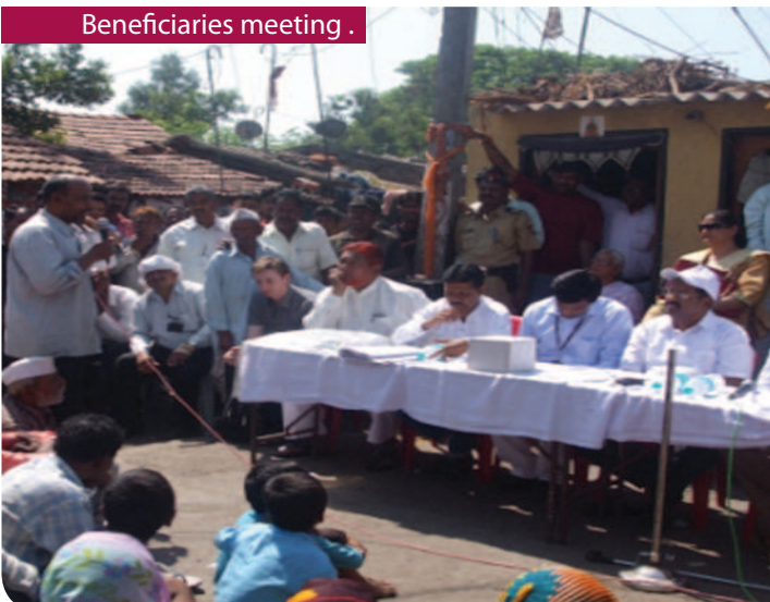
Beneficiaries meeting .

The Mayor, Municipal Commissioner and Shelter Associates visit the Sanjaynagar Slum to discuss the project and the details of relocation.