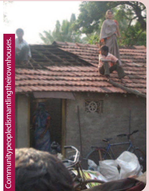
Community people dismantling their own houses.

The community members quickly signed affidavits in support of the rehabilitation of their slum and fought the opposition in court at the beginning of October 2011. This collective effort resulted in the court vacating the Stay Order and issuing orders for the relocation of the slum in a phased manner to the transit camp. The order stated that everyday the ULB should shift 50 families and should provide them with support in terms of transport and labour as required. A report to this effect had to be submitted, with the signatures of the 50 families, at the end of each day to the court. The ULB complied fully with the order and within a week 372 families were relocated to the transition camp.