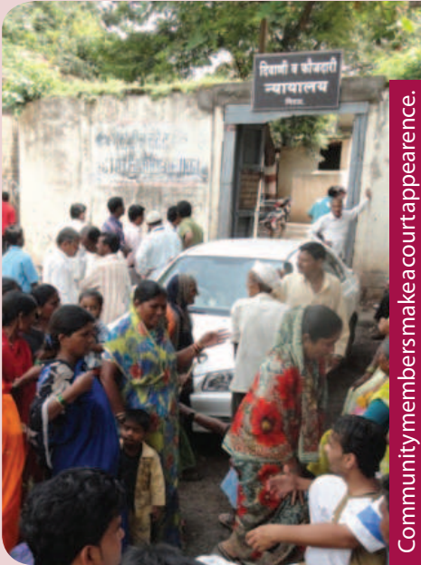
Community members make a court appearance.

Two sites were lost in these legal battles due to poor representation in court; it became apparent to the ULB that the legal cases were not getting adequate representation due to the lack of communication between them and the appointed legal advisor. The advocates competency was also called into question and resulted in the appointment of another lawyer. The new advocate was given able support by the slum department, SA, the Corporator and the community leaders.