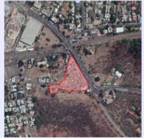
Location Map of Jamsandekar Mal

Through its surveys SA had realized the need of individual toilets in this slum. But as laid down conditions by CSR funders, Shelter Associates is bound to carry out its OHOT projects only on government land.