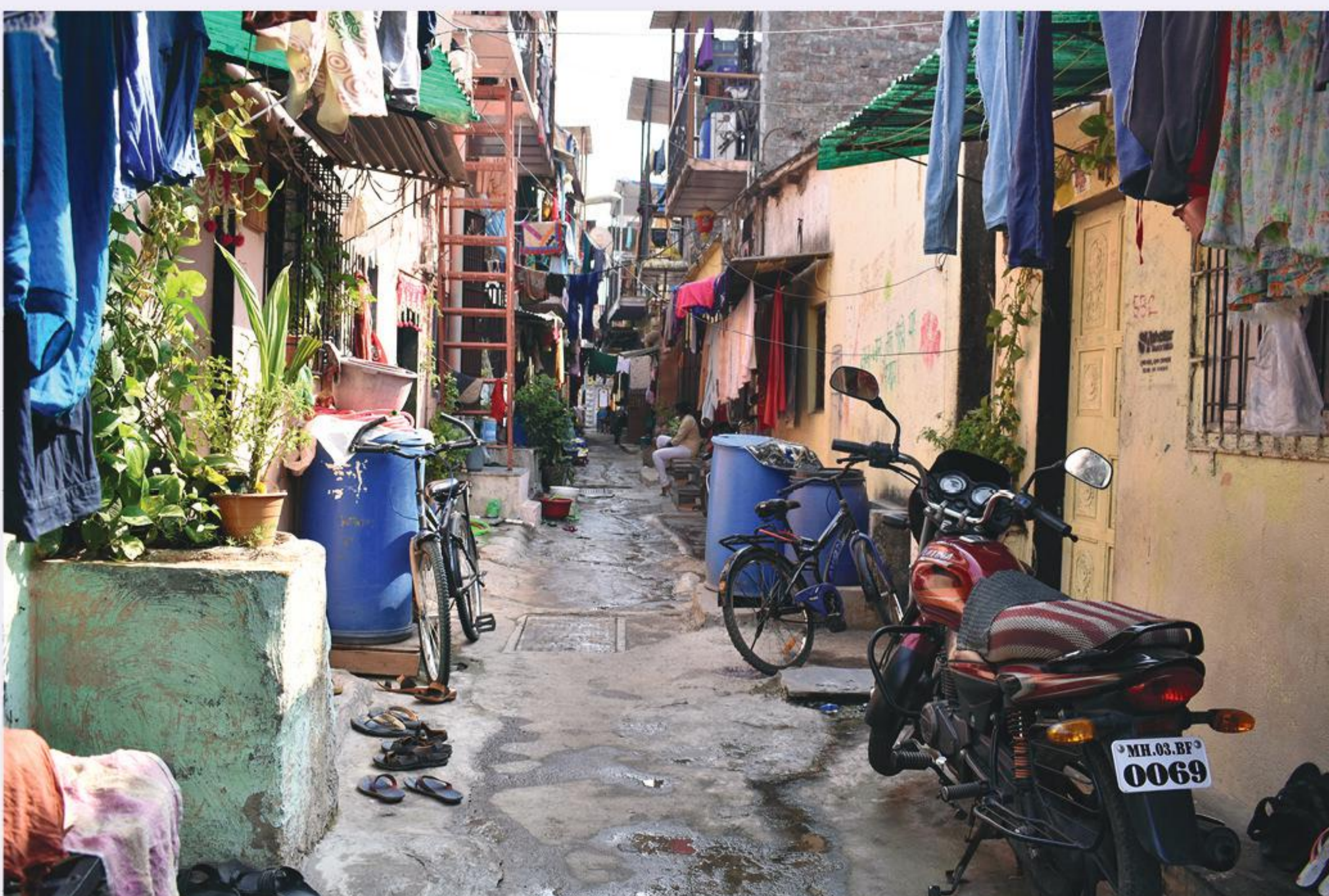
Fig 7. The street in front of the House of Ramahar Bhaluram