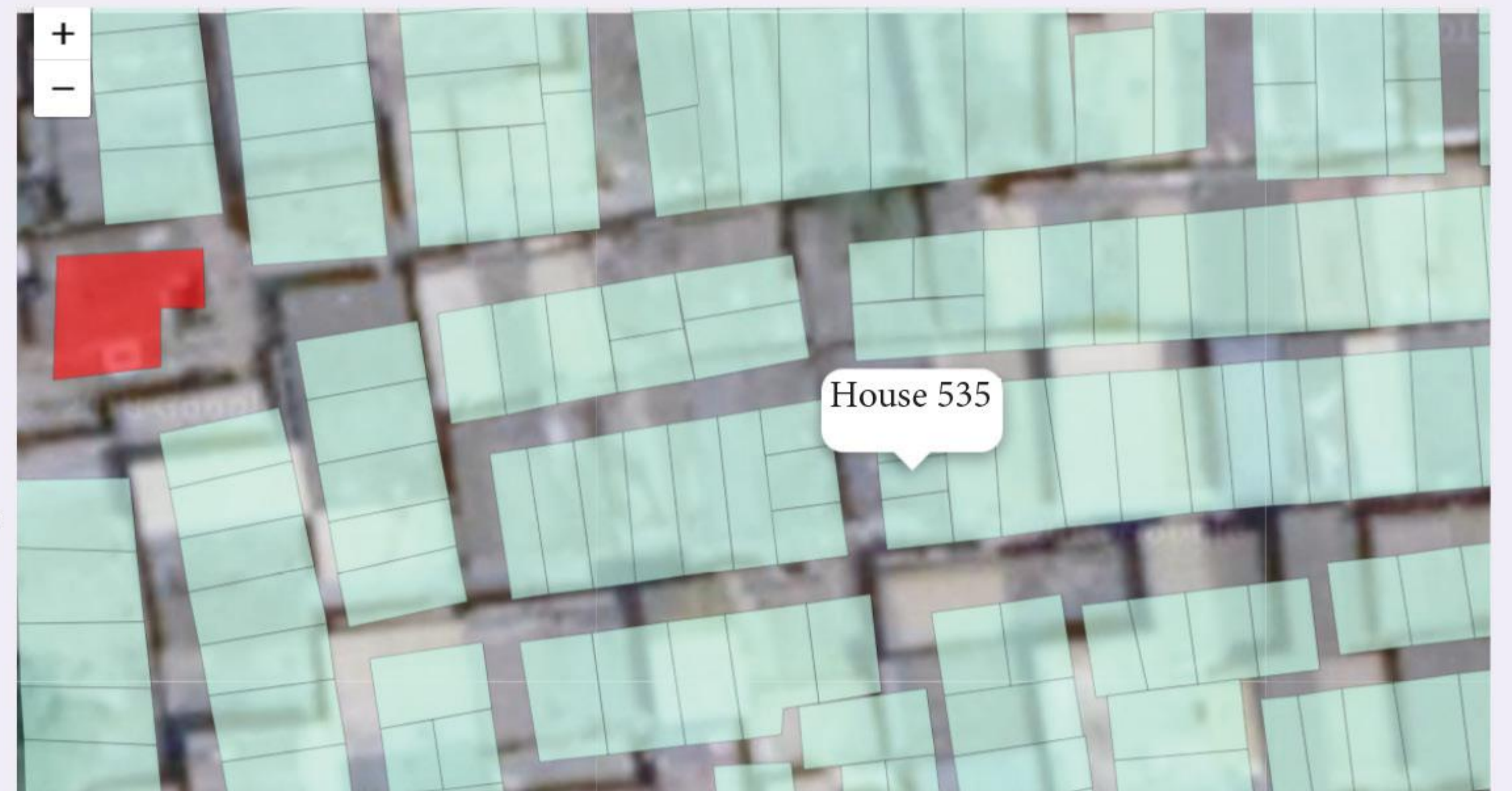
Fig 2. House 535, located in Sainathwadi