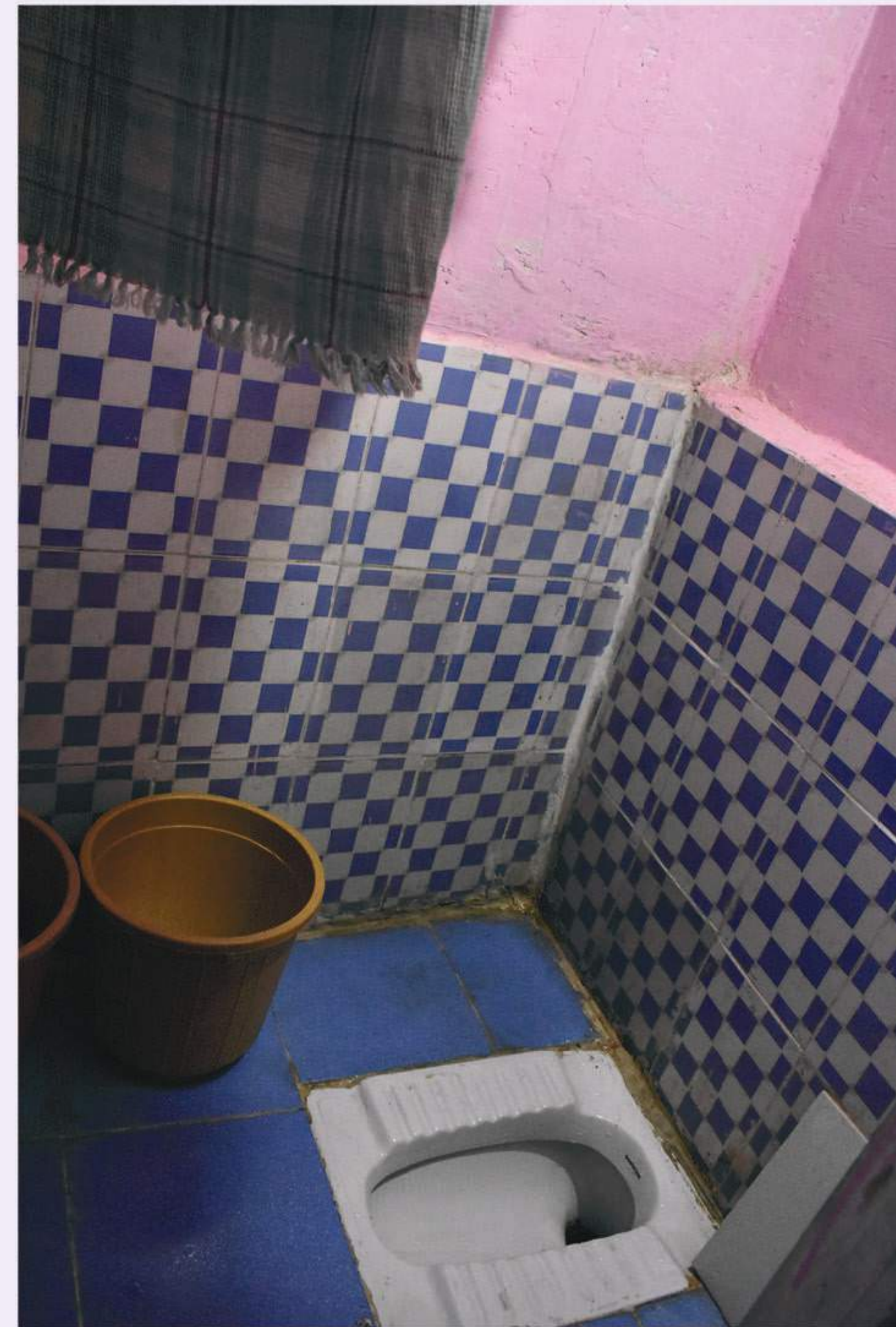
Fig 5. Image of the toilet that is 4ft by 3 ft.

The slum falls under the Forest Department of India; however, they are not involved with the facilities provided to the community. Most of the people work in the close by industrial factories and earn ₹250 for a day. The C.T. B's in Sambhaji Nagar are free of charge. The houses in this settlement are mostly kaccha houses made of aluminum sheets and bamboo sticks. A large number of people living in this slum belong to the tribal community and they do a lot of Warli paintings.