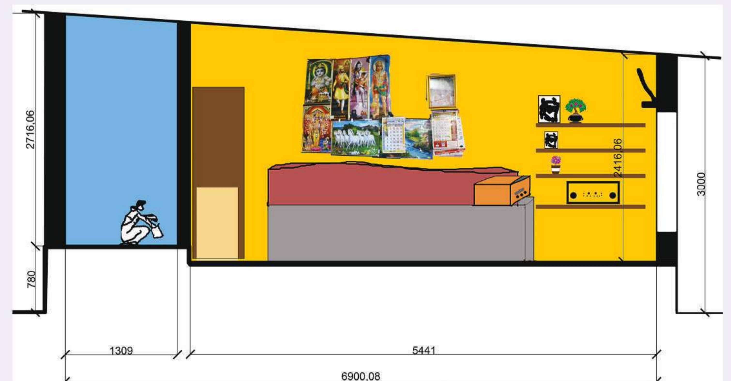
Fig 4. Section of the House No. 350 (not to scale,

The couple decided to get their own toilet because there were only two community toilet blocks out of which one of them did not have proper locks and the other wasn't maintained well. There were times that the husband had to accompany his wife to the C.T.B and it used to become difficult at times when he wasn't at home.