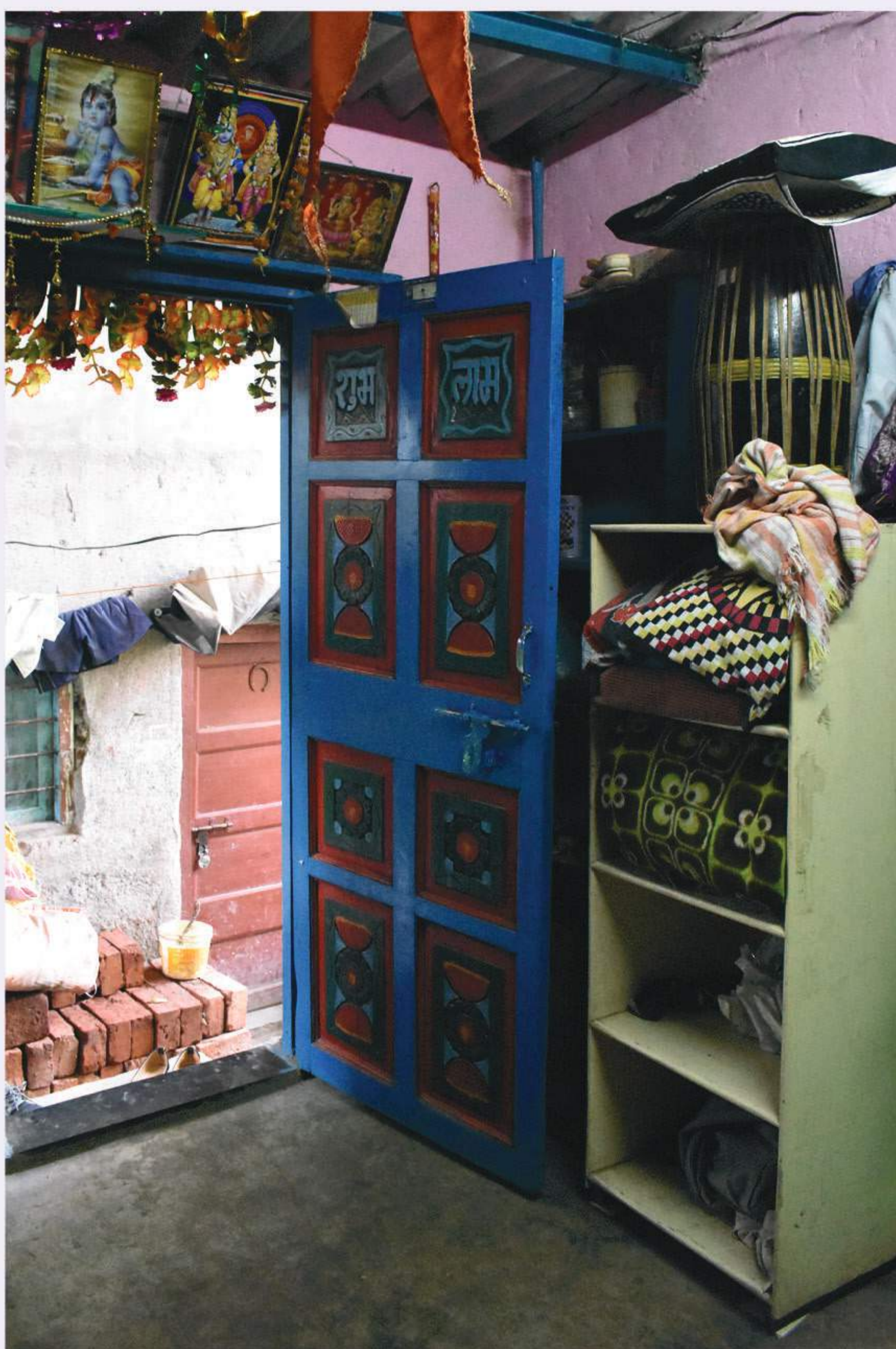
Fig 7. "Shub laab" written on the door, with idols of God on the door.