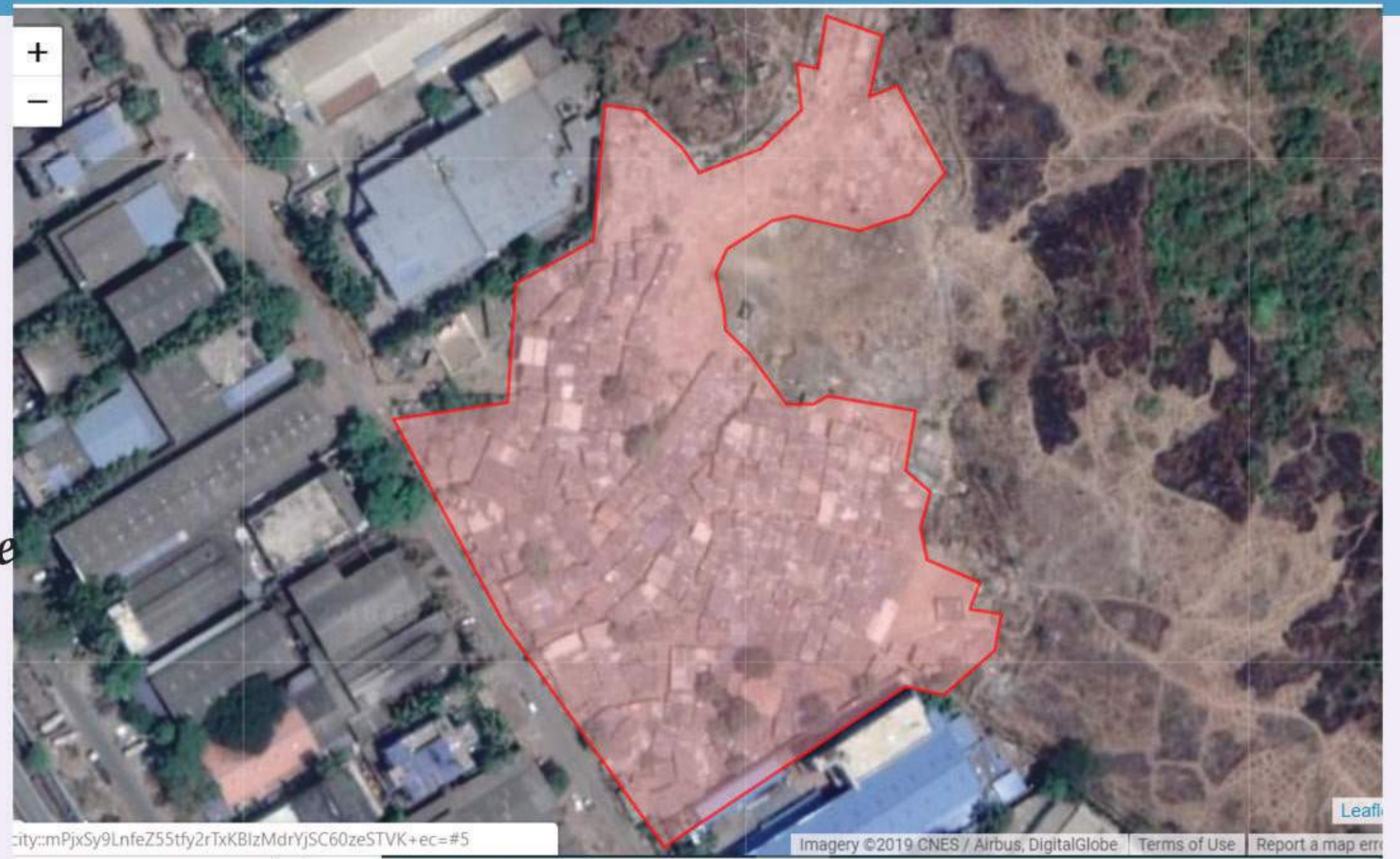
Fig 1. Sambhaji Nagar Plan.