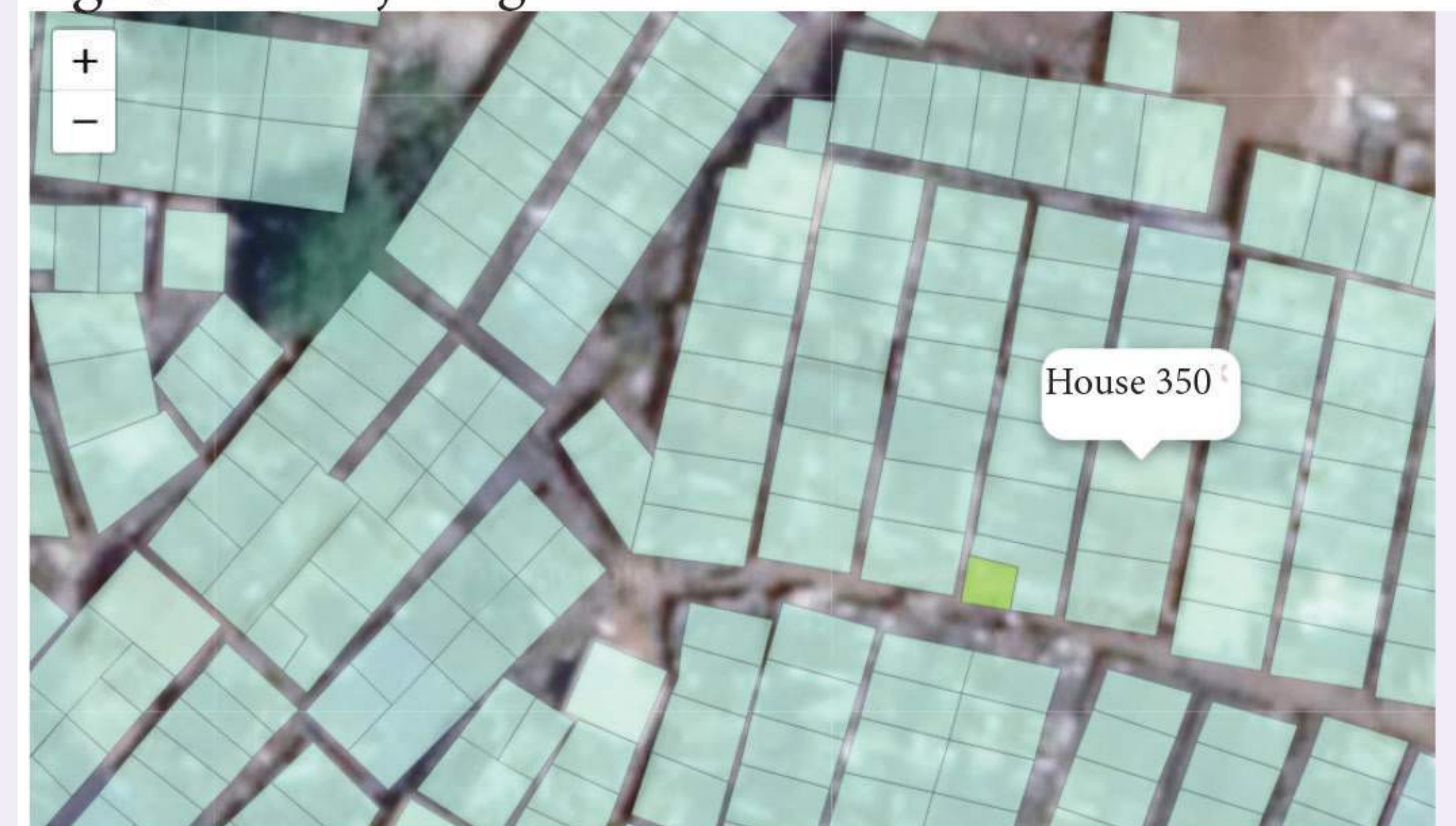
Fig 2. House No. 350, location in Sambhaji Nagar