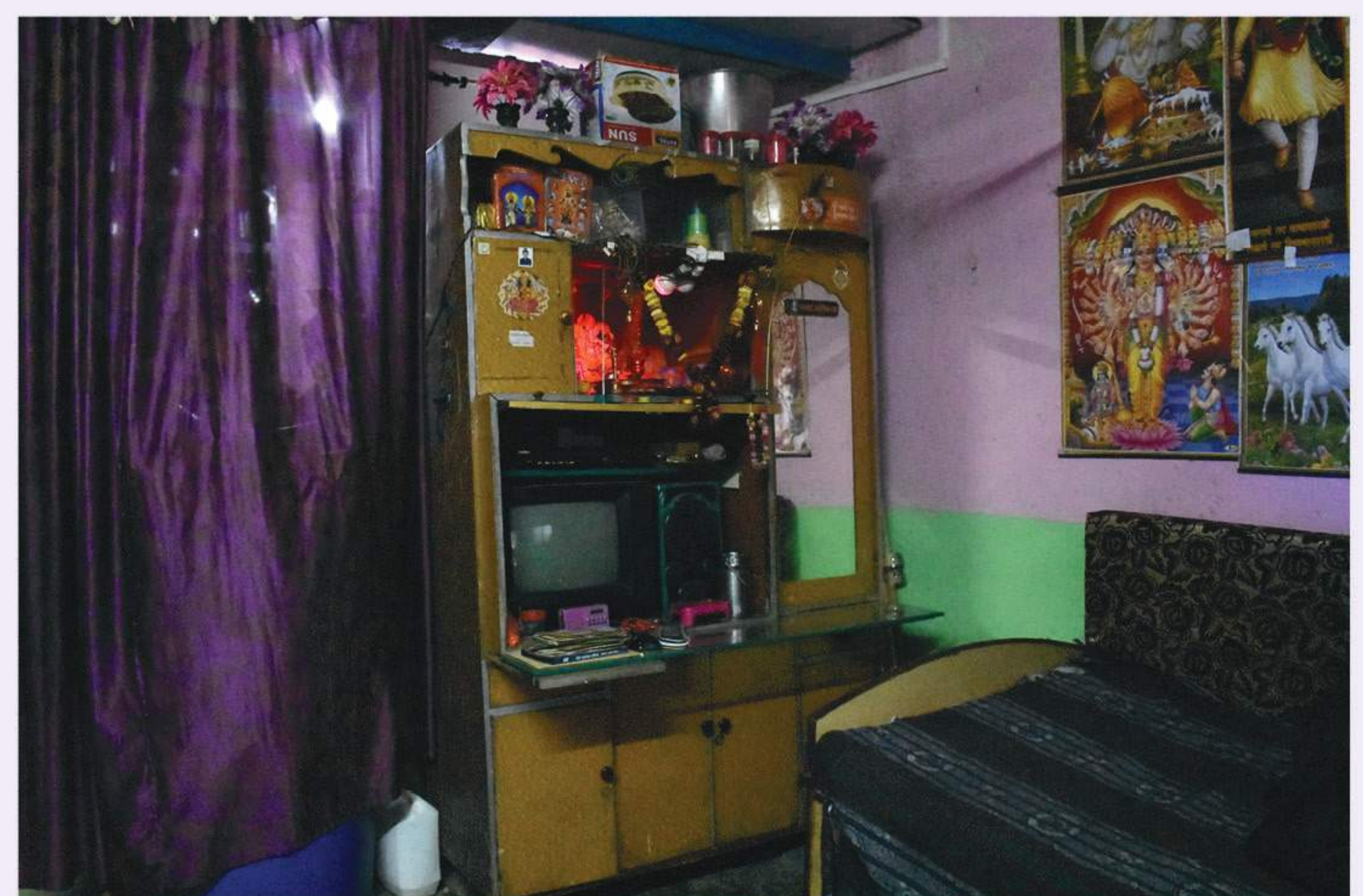
Fig 8. The living room with deity's images.