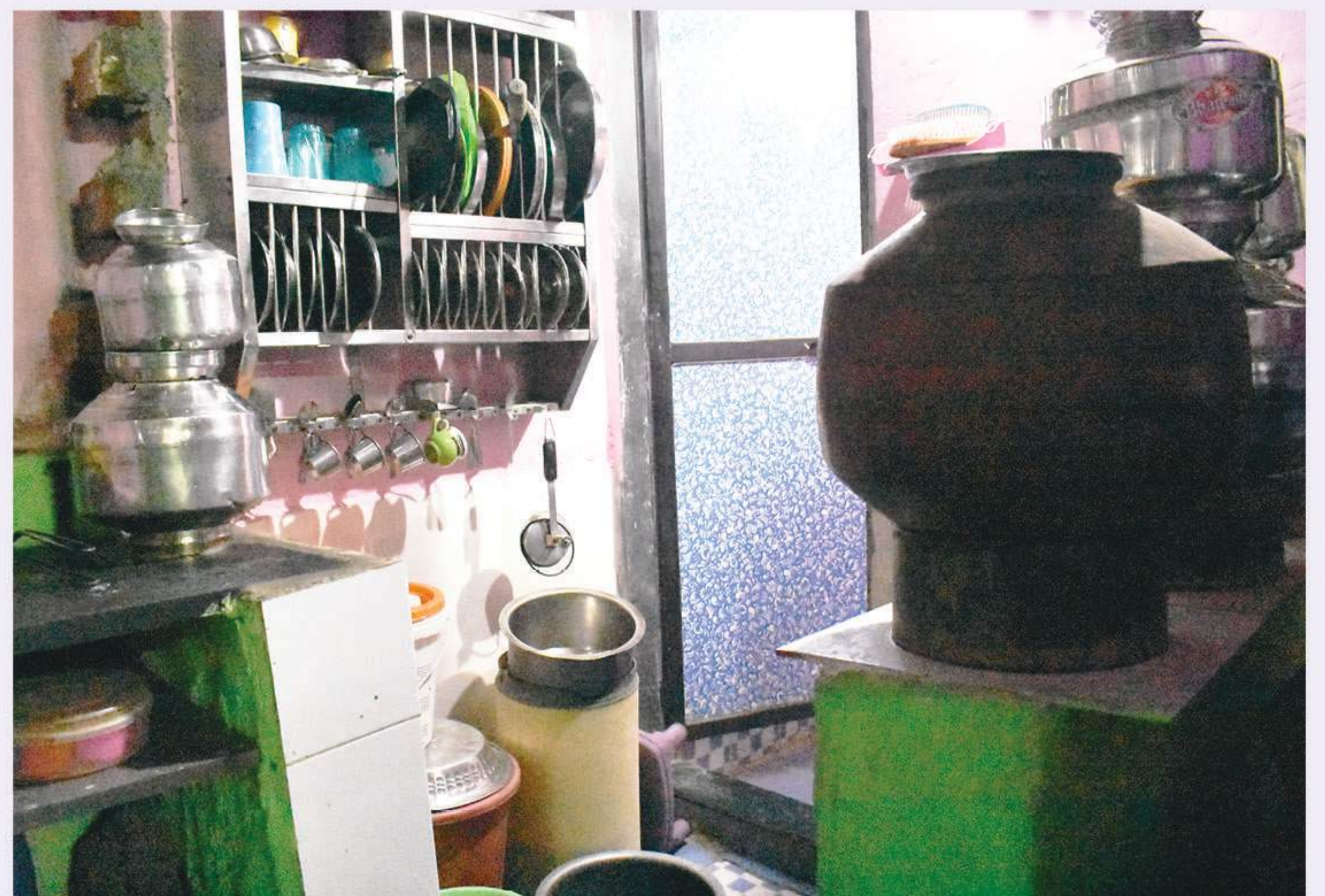
Fig 6. Mori that is presently used as a bath area