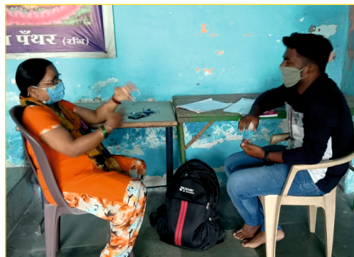
Meeting with the community women leaders for finding project volunteers