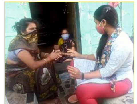
Speaking with slum families to find volunteers for the project