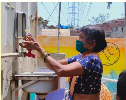
Families using soap from the dispenser to wash hands