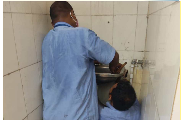
Installing elbow operated taps

Recognising the possible dangers, Shelter Associates is working in the informal settlements of Turbhe Ward, Navi Mumbai, Maharashtra to provide WASH supplies in order to minimize the risks of COVID19 infection. Elbow operated taps and soaps dispensers are installed at the community toilets in four informal settlements to avoid high-touch areas & maintain hand hygiene. The need was derived through a detailed the Community Toilet Block Analysis conducted by Shelter Associates in these settlements. The intervention is being supported by IKEA India in partnership with Collective Good Foundation.