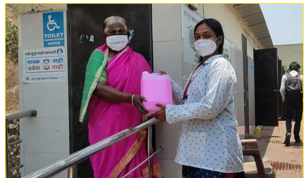
Handwash liquid given to CTB caretakers for refill