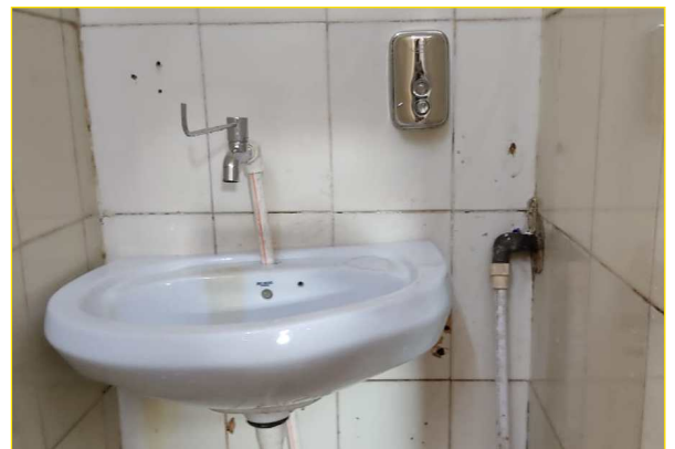
Elbow operated tap and soap dispenser