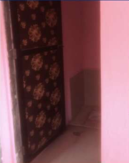
Toilet after construction.

When she heard about 'One Home One Toilet' project which had picked up it's momentum in their settlement, she was very interested. Due to her heavy monthly outgoings spent on medical treatments, she was unfortunately not financially sound enough to spend on getting a toilet constructed. Nonetheless, she did not lose hope; dreamed big and thought of renovating her entire house along with building a toilet. She procured a loan of about Rs. 2 lakhs and started renovating her house. She converted her kuccha house into a semi pakka house with plinth, concrete walls and tin roof.