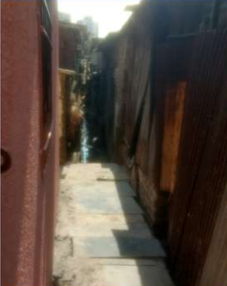
Open gutter along their house.

Her family also had to go through severe sanitation problems as their house was situated along an open gutter and they lived in a kuccha house with no plinth. So during monsoons, the situation would worsen as their house would constantly be flooded & water logged for 3-4 months making it very unhygienic. The absence of a household toilet added to their troubles in such situations.